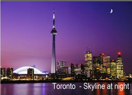
Toronto - Skyline at night