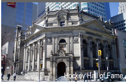
Hockey Hall of Fame