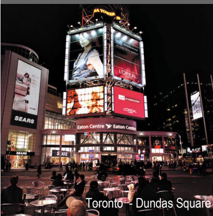
Toronto - Dundas Square